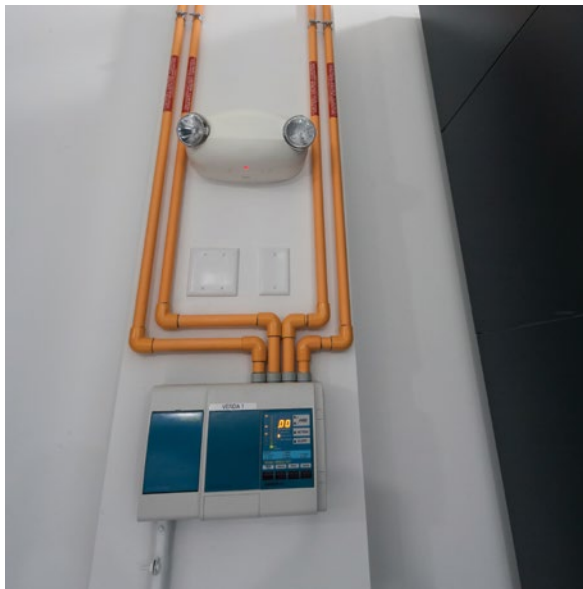
The computer room VESDA system provides early smoke detection in the facility.

“Customers can feel comfortable that their mission critical infrastructure is being supported by a proven facility design and operations team.”