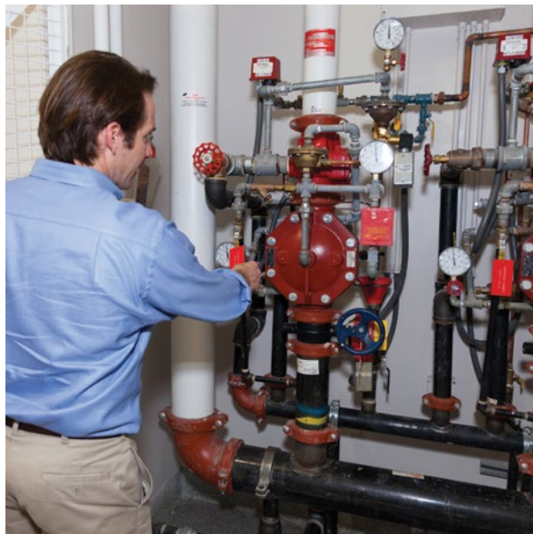
Water for the sprinkler system is held outside of the computer rooms to prevent accidental leaks.