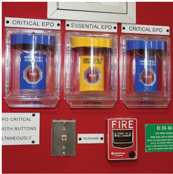
Computer Room Fire System Control Panel.