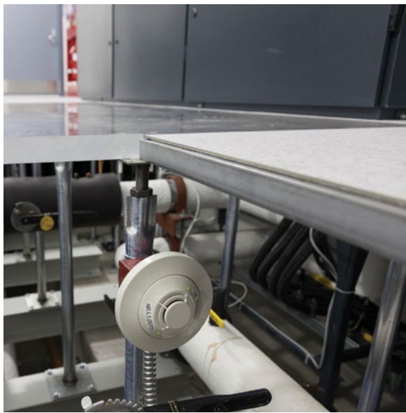
Computer Room Smoke Detector - Located under the raised floor.